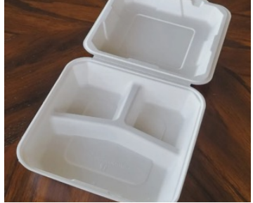
Clamshell from Plant Fibers by Pactiv Evergreen

USDA Certified Biobased Product: 99% Biobased