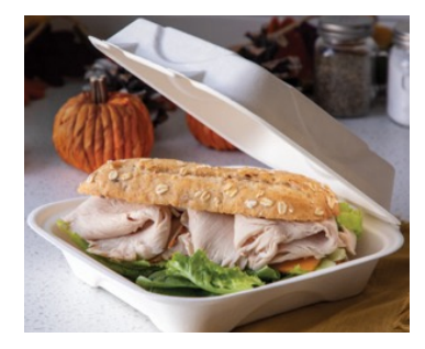
Clamshell from Sugarcane: Eco-Products, Inc.

USDA Certified Biobased Product: 99% Biobased